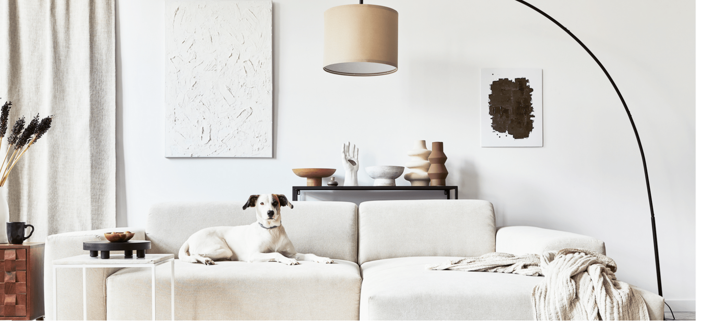
Finding the Perfect Fit: Tips for Lamp Shade Replacement